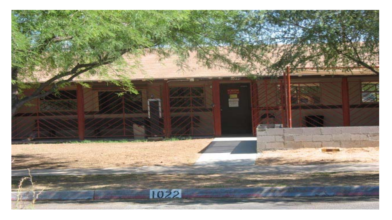
Front of Garfield after the transition in March 2006

Seeing as how we are still in the transition stage, this article is merely a sneak peak look into where we started and where we are headed. Still everyone is invited to stop by and /or take advantage of the new training/tour being offered through Staff Development. As the progress continues we will keep everyone informed, and upon completion we will be asking all our friends, co-workers, probation partners and neighbors to join us for a grand opening celebration of the new and improved Garfield.