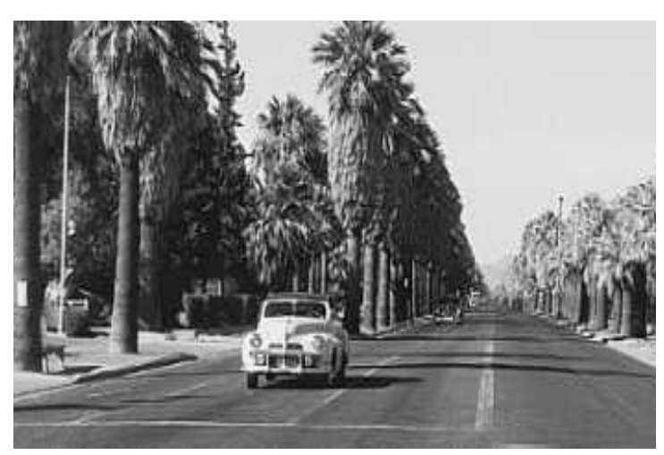
Central/McDowell in 1880