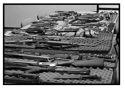
Weapons confiscated during a search conducted by MCAPD staff.

Recently, Chief Broderick had the pleasure to hand out commendation letters to IPS and Standard officers working out of the WRDC office. The officers were recognized for their actions in two searches.