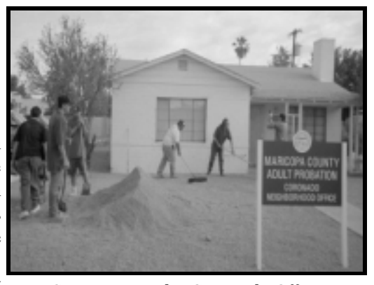
Sprucing up the Coronado Office

Crime is a common topic at association meetings and community residents are always trying to figure out ways to make their neighbor-