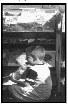
A boy thinks about a book at a book give-away sponsored by MCAPD.

Times like these - with looming budget concerns - indicate just how important it is to inform the public of our function and of the tremendous contribution we make to public safety and quality of life. Without public support, we cannot garner legislative support.