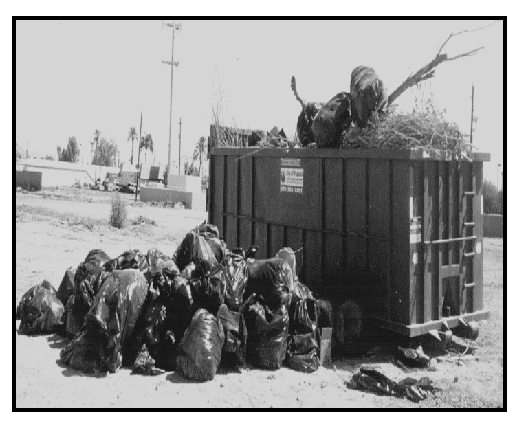
One of the 4 full dumpsters of trash collected in the clean up.