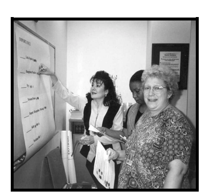
A group prioritizes concerns.