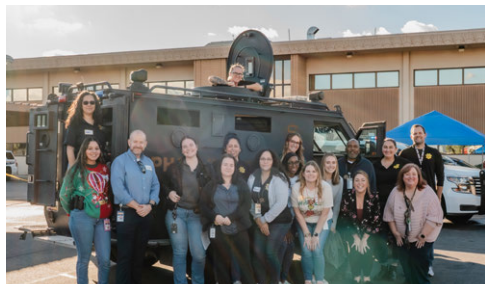
APD employees stop for a photo with a Phoenix Police Department SWAT vehicle.

The Judicial Branch continues to be tremendously proud of this event as it reflects the very best of who the Judicial Branch is.