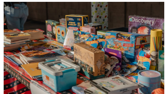
One of many tables full of toys donated for the event.