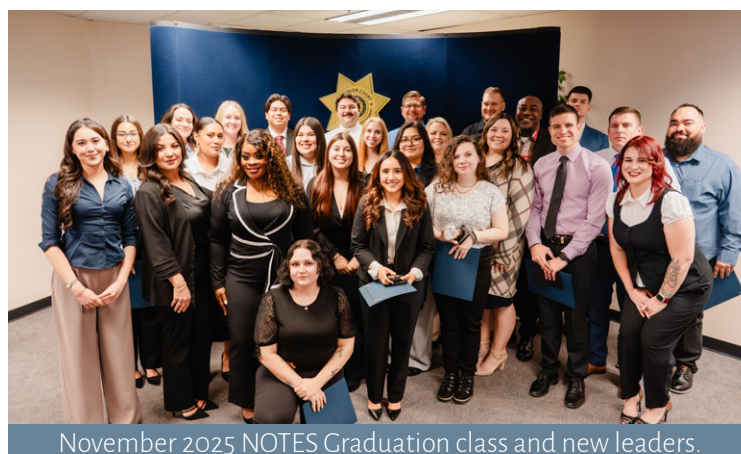
November 2025 NOTES Graduation class and new leaders.