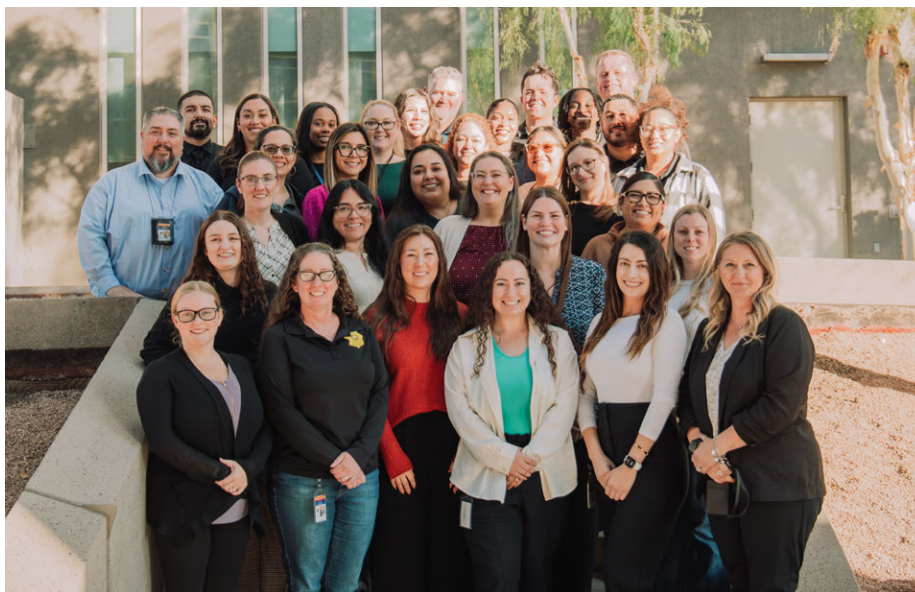
December 2025 ELM Graduates.

For employees of APD interested in participating in the ELM Program, Staff Development regularly provides information on how to apply. Keep in mind, space is limited, and seats often fill up very quickly!