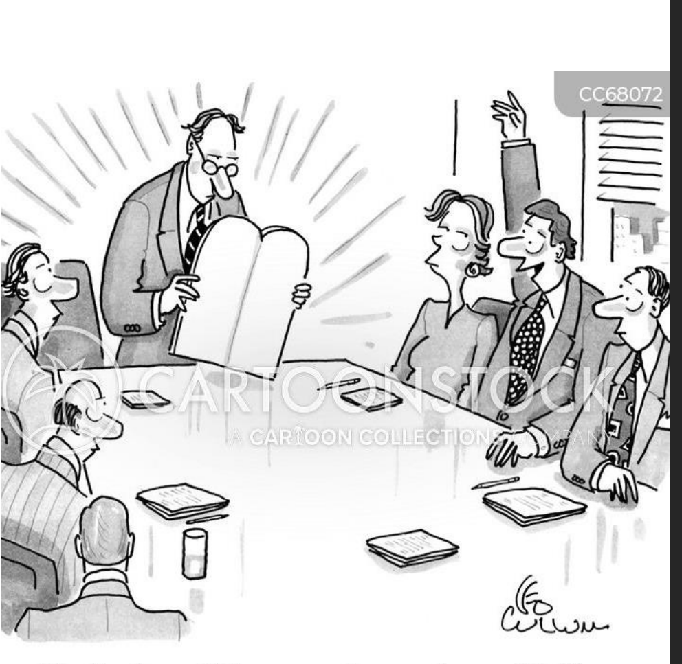
"Are these just guidelines, or are they actual new policies?"