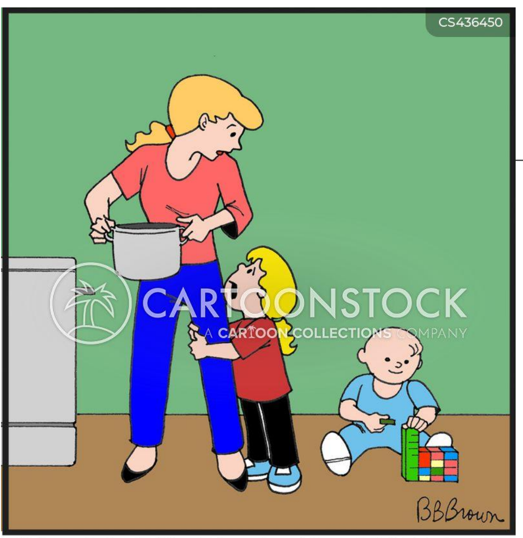
"Mom, I don't like being the oldest child. It's lonely at the top."